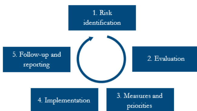
Figure 2 The risk management process

Risk identification: The Debt Office is to have processes and methods for identifying risks in the operations.